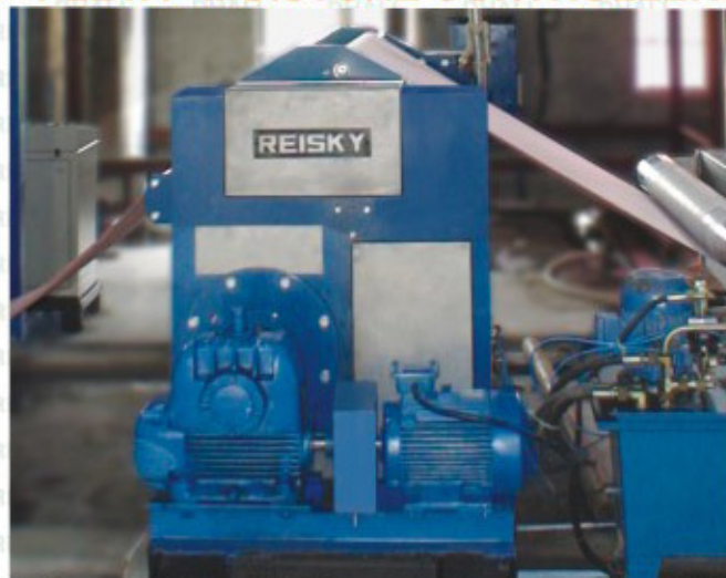
REISKY - DHALL DYE PADDER WITH TWO HYDRAULIC DEFLECTION CONTROLLED ROLLS