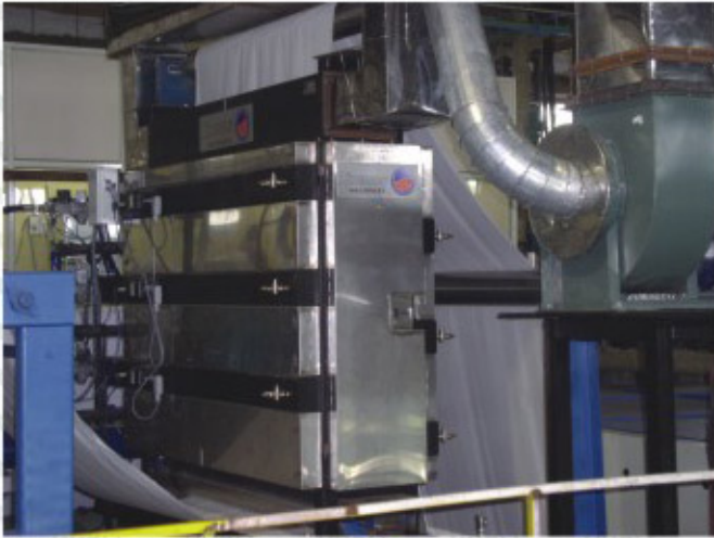
Zimmer Gas fired infrared drier