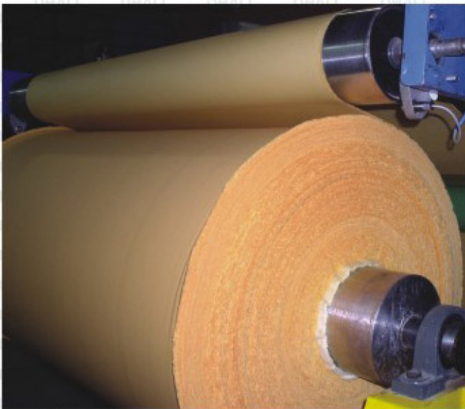
Contact less batch