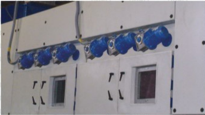
Individual motor drive system on alternate rolls